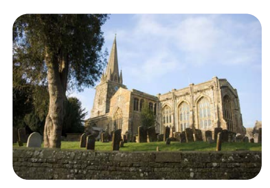
St Mary's Church, Adderbury