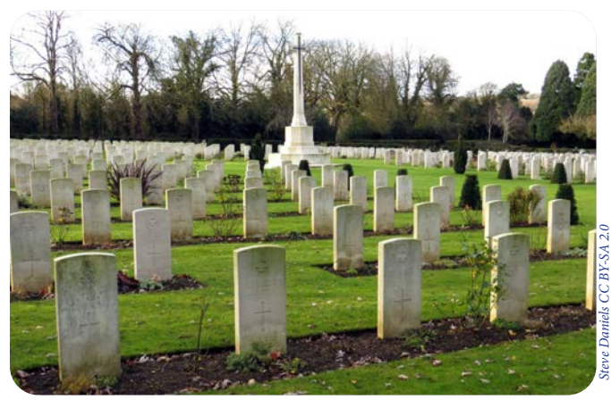
Commonwealth War Graves, Botley Cemetery