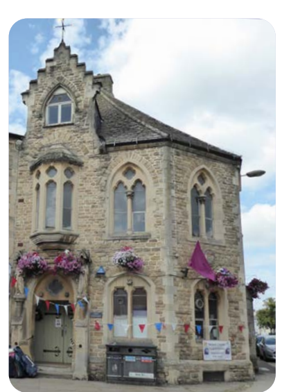
The Corn Exchange, Faringdon

Oxfordshire Past this year will take place in Faringdon at the Corn Exchange on Saturday 14th June from 10am to 4pm and will include the OAHS Annual General Meeting. The day will once again involve a diverse programme of talks, including the county round-ups, recent research around the county and on